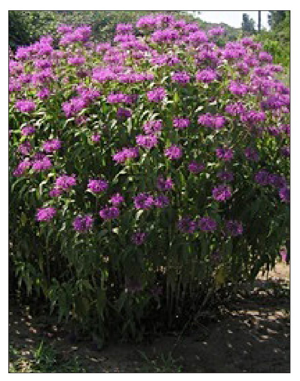
Figure 2. Monarda fistulosa variety Fortuna

and 3.0–3.5 cm wide. Central shoots end in inflorescence. The flowers are small, gathered in compact spherical heads at the ends of the stems. Corolla is purple. The diameter of the inflorescence is 6.5–7.5 cm. The fruits are small brown nuts (Fig. 2).