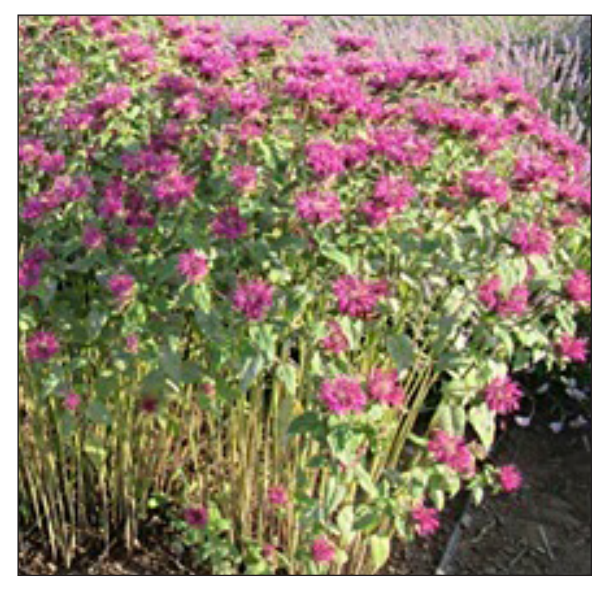
Figure 4. Monarda × hybrida hort. variety Tonya