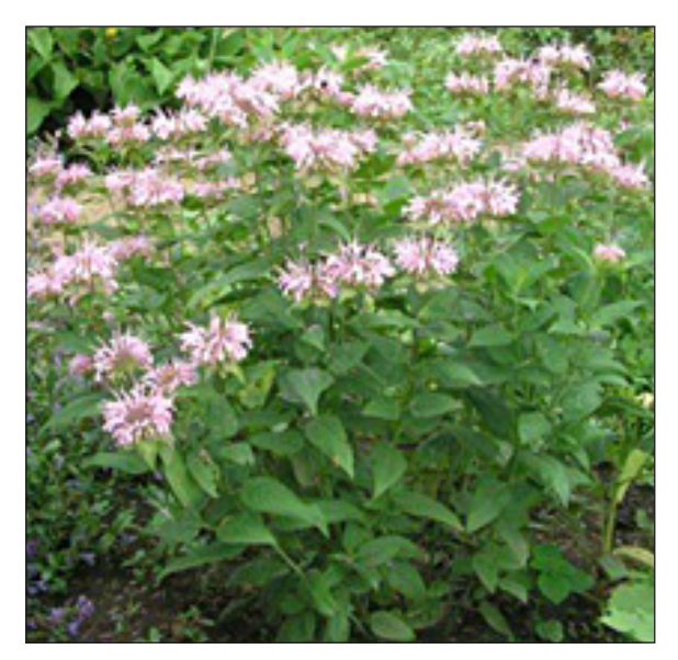
Figure 3. Monarda didyma variety Nizhnist

The authors determined that during the phase of abundant flowering, the mass fraction of essential oil in the aboveground mass of plants of the studied varieties of Monarda fistulosa L. ranged from 0.7% to 0.8% of the total raw mass, exceeding the minimum values of M. × hybrida hort. Tonya variety by 55.6-77.8%. The concentration of essential oil in the aboveground mass of plants of Monarda didyma L. Nizhnist variety was lower by 37.5% and 28.6%, compared to the varieties of Monarda fistulosa L. Premiera and Fortuna correspondingly, constituting 0.5% of total the raw mass. The obtained data confirm the findings of studies conducted in the traditional area of Monarda cultivation, Crimea, in which the content of essential oil in the aboveground