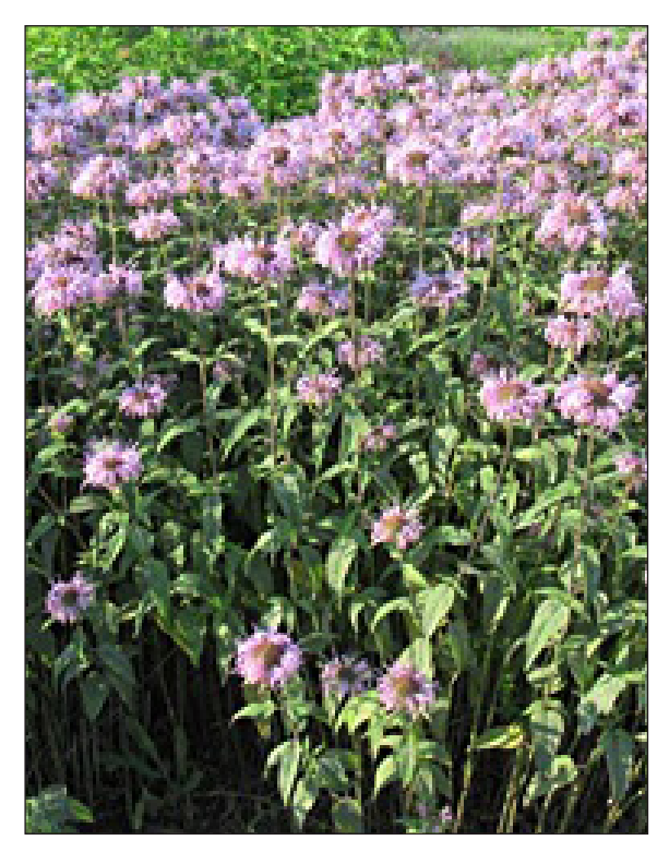
Figure 1. Monarda fistulosa variety Premiera